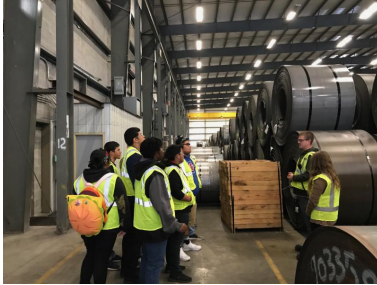
Portage EDC Manufacturing 360 at the Ports of Indiana