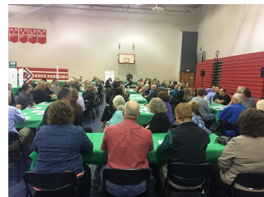
Starke County Economic Development Foundation Manufacturing Fair