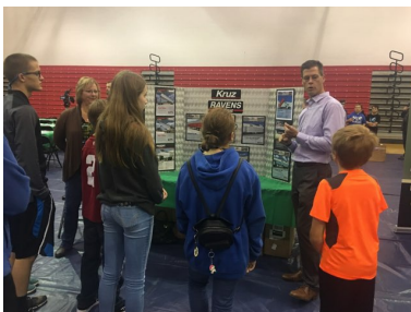
Starke County Economic Development Foundation Manufacturing Fair