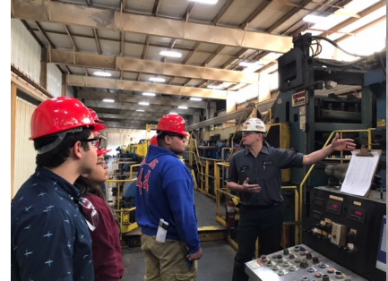
Portage EDC Manufacturing 360 at the Ports of Indiana