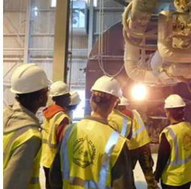
Merrillville Schools at Carause Lime and Stone in Gary