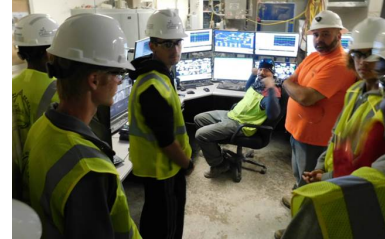
Merrillville Schools at Carause Lime and Stone in Gary