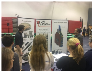
Starke County Economic Development Foundation Manufacturing Fair