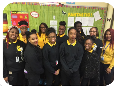
Roosevelt's National Honor Society