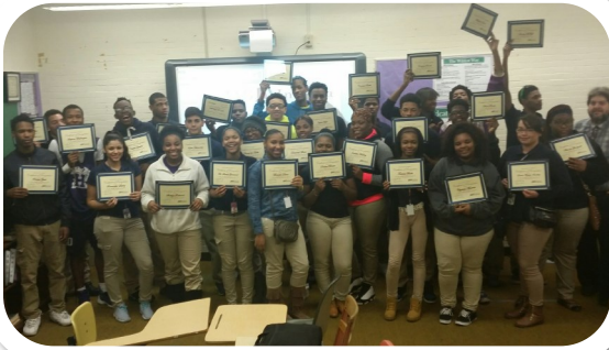
Hammond High School